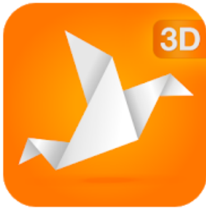
How to Make Origami

I recommend the following apps for your iPad. Second grade students have worked on this app in my room.